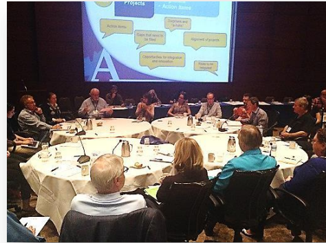
Closing day plenary

A second explored the specialty of bioinformatics and strategized on integrating data across AllerGen's research teams, while the third delved into "personalized health," proposed as a potential unifying framework for AllerGen's various research thrusts.