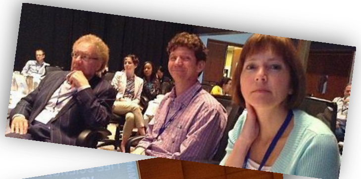
Scenes and faces from the 2014 Scientific Meeting