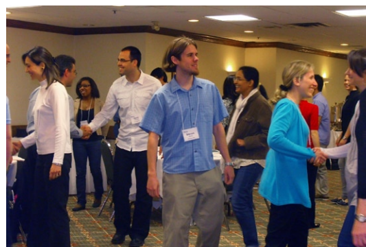
AllerGen trainees practice using professional voice and body language.

Presentation slides from the Trainee Symposium are available on the AllerGen website, http://www.allergen-nce.ca/Events/Past_Events/2010_Trainee_Symposium.html .