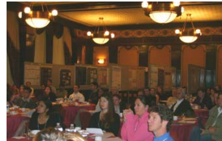
Trainee Day at the Intercontinental Hotel in Montréal, PQ.