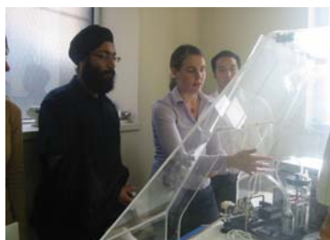
SCIREQ staff demonstrate flexiVent apparatus